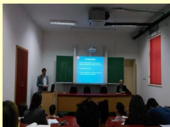
Picture from the meeting in Trebinje