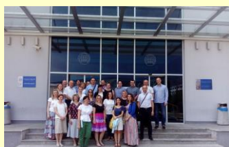
Joint picture in front of the SVEMO