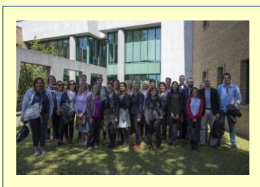
Joint picture in front of the IPP